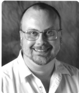
ROBERT J. SAWYER